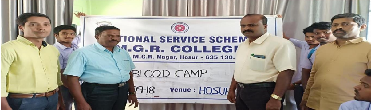
Blood donation activities during 2019-2020