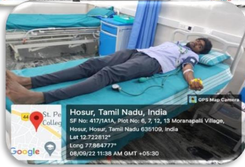
Blood donation for public (St.Peters Medical College and Hospital, Hosur) during 2022-2023