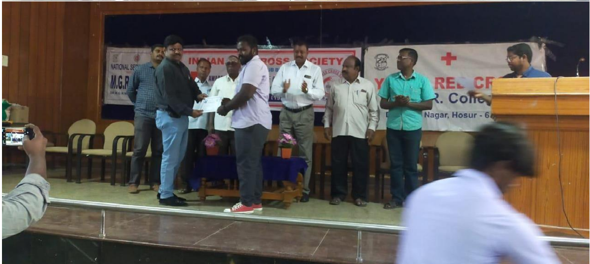
College students are receiving appreciation Certificate for Blood donation