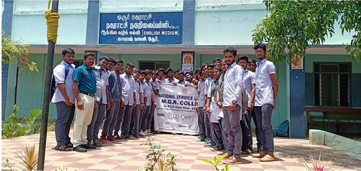
Blood donation activities during 2019-2020