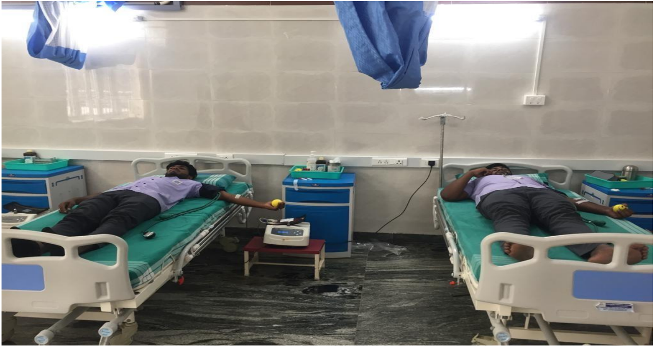
Blood donation for public (Lions Blood Bank Hosur)